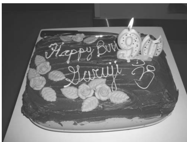
Birthday Cake at the Iyengar Yoga Centre of Hong Kong

In Iyengar yoga, asana and pranayama are the ways that we “meditate on our cow.” They gradually train our concentration so that we can keep a steady mind wherever we are, whatever we are doing. They train our mind so that it cannot be swept away by an impulsive desire or fear; so that it cannot be haunted by an unpleasant memory or anxiety about the future. In this practice, the asana serves as a mantram. It represents the Divine – invoked again and again in asana practice. The pranayama breath also serves the same purpose. After years of practice, we're told, our every movement, our every breath – both in yoga and in daily life – becomes charged with the Divine. And in this way, our awareness of the Divine within us gradually comes to life. ♥